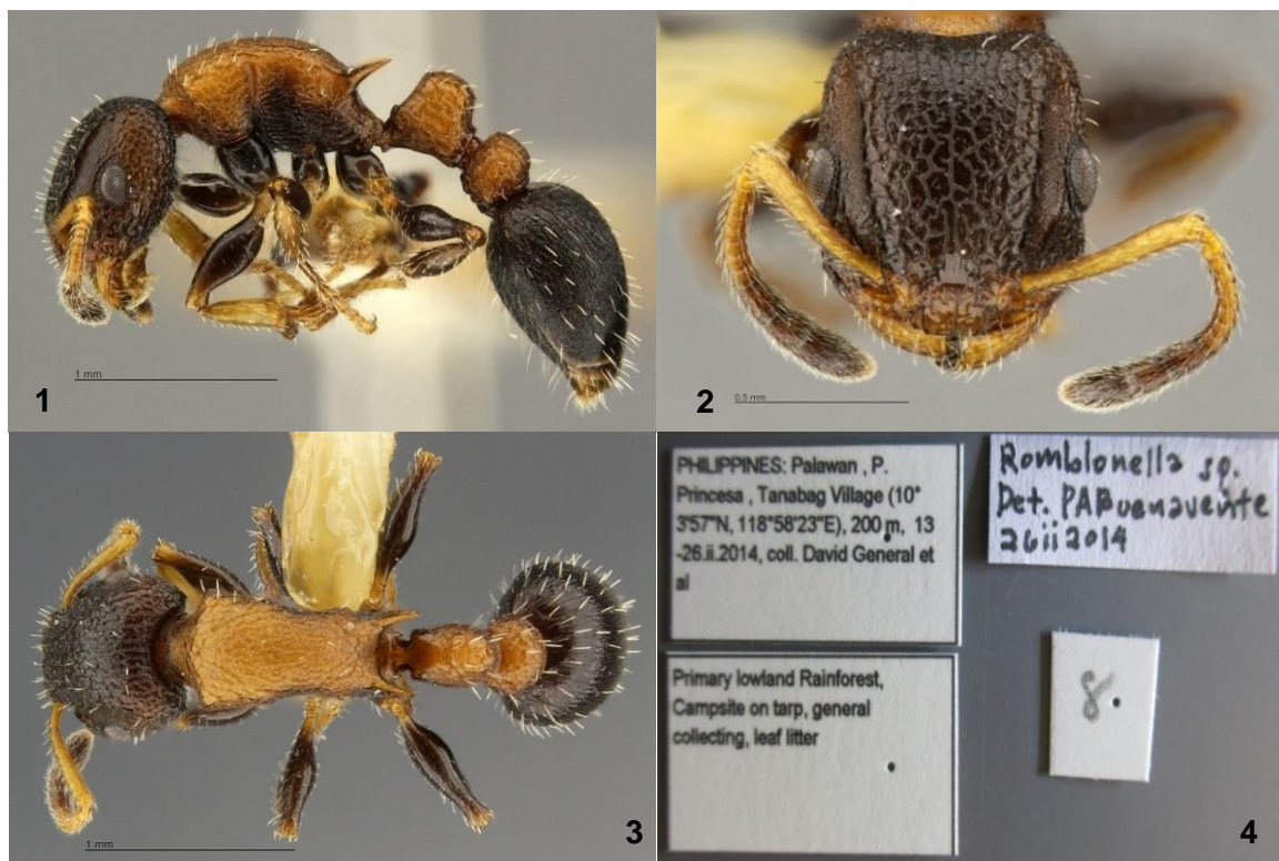
Figures 1-4. Romblonella coryae sp.n. (holotype). 1. Lateral habitus; 2. Full-face view of head; 3. Dorsal view of body; 4. Labels.

Etymology: This species is named in honor of our late former President, Corazon C. Aquino (known to all Filipinos by her nickname "Cory"), who led the country out of the dictatorship era. It is fitting that a genus named after a Philippine island has a species named after a modern Filipino hero.