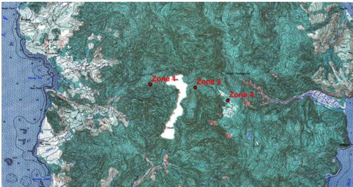
Figure 2. Map of sampling points, representing Zones 1, 3 and 4, overlaid on a topographic map (large white region is labeled “clouds”) (NAMRIA 2017)