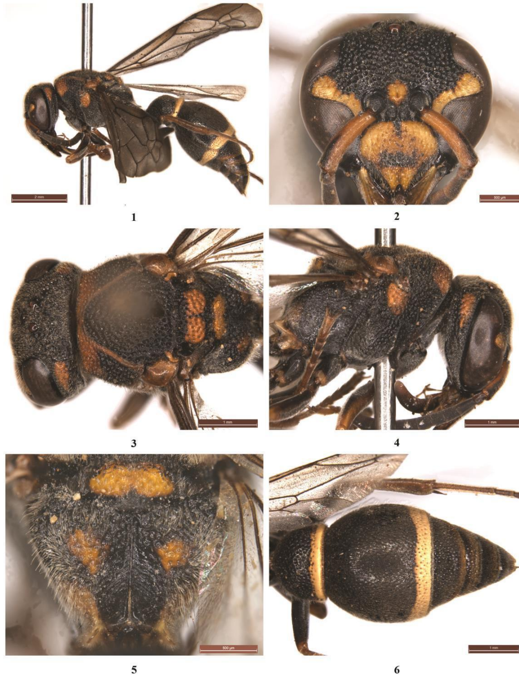
Figs. 1–6. Apodynerus formosensis indicus Giordani Soika ♀. 1. Body profile; 2. Head frontal view; 3. Head & mesosoma dorsal view; 4. Head & mesosoma lateral view; 5. Propodeum; 6. Metasoma dorsal view.